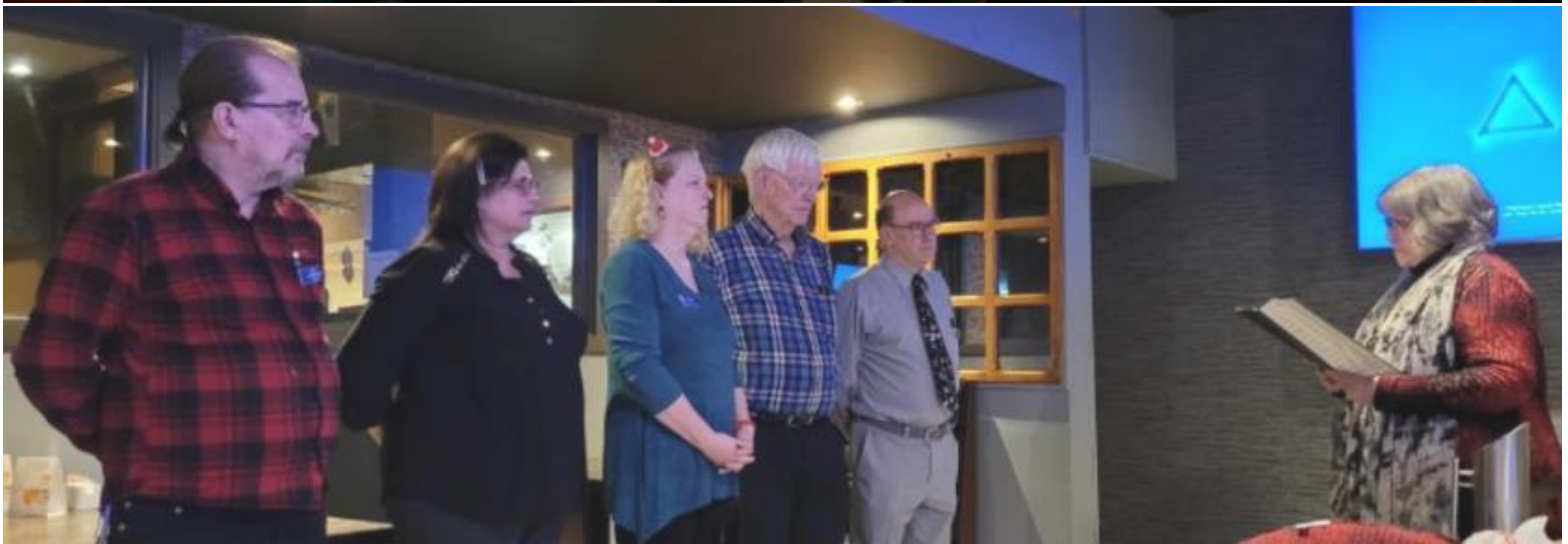
Installation of the 2022-23 Agincourt Civitan Club board of Directors. Dec 14 th .