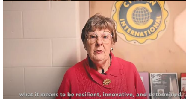
Left: February 25 Food Drive for C.L.H. Food Drive